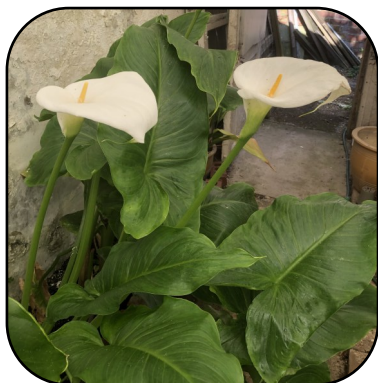
Lilies and peaches grown locally