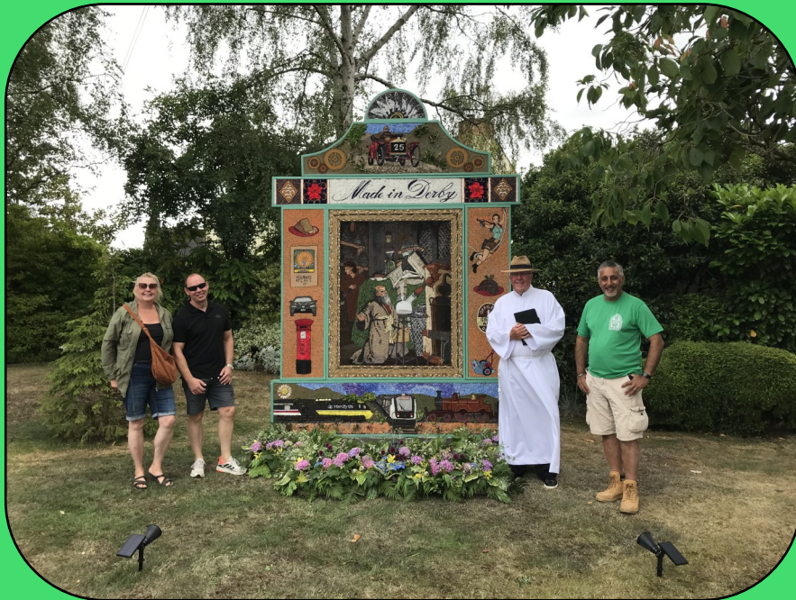
The main well dressing at Aston on Trent